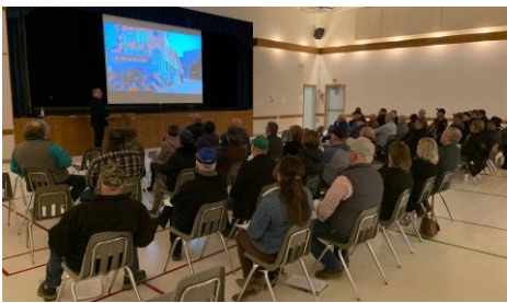
46 people attended the Jansen open house, held at the community hall on Apr. 26, 2022.

The April 26 th open house at Jansen was attended by 46 people; the April 27 th open house at Nokomis had 30 people in attendance. There was a good cross section of community members, local leadership and some representation from the provincial government. First Nations leadership was not present at the open houses, however, one company that has a Joint Venture with George Gordon First Nation was in attendance. BHP was involved in the open houses to provide a brief update on the BHP Jansen Project and to answer any BHP-specific questions. These CN led open houses follow four BHP-led open houses that took place in Nokomis and Jansen between 2017 and 2018, which were attended by 220 people in total.