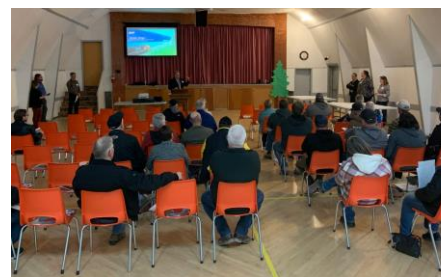
30 people attended the Nokomis open house, held at the community hall on Apr. 27, 2022.

Open House format included: introductions; treaty land acknowledgment; overview of BHP's community complaints and grievance process; value share; overview of the BHP Jansen Project; overview of the proposed CN Access Spur project; overview of the CTA application process; proposed routing for the Access Spur (with maps provided); contracting opportunities for locals; and a fulsome question-and-answer period.