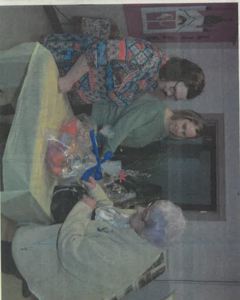
Easter bread gift baskets were also being sold during the Tea and Bake Sale.